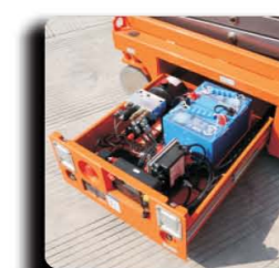
Slide Out Tray