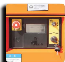
Touch Display Screen